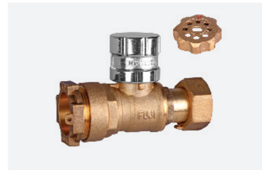
MAGNETIC STRAIGHT LOCKABLE BALL VALVE (FOR HDPE PIPE WITH COUPLING-NORMAL TYPE) - Kelas: PN10/PN16 - Sistem sambungan: inlet compression fitting (untuk disambung pipa plastik) dan outlet coupling ring dengan ulir 3/4" standar BSPP/ISO 228/1 - Ukuran: DN15 x 3/4" x 20 mm, DN15 x 3/4" x 25 mm - Dilengkapi alat pengunci sistem magnetis - Class: PN10/PN16 - Connection system: inlet compression fitting (to connect plastic pipe) and outlet coupling ring with thread 3/4" standard BSPP/ISO 228/1 - Size: DN15 x 3/4" x 20 mm, DN15 x 3/4" x 25 mm - Equipped with a magnetic locking system