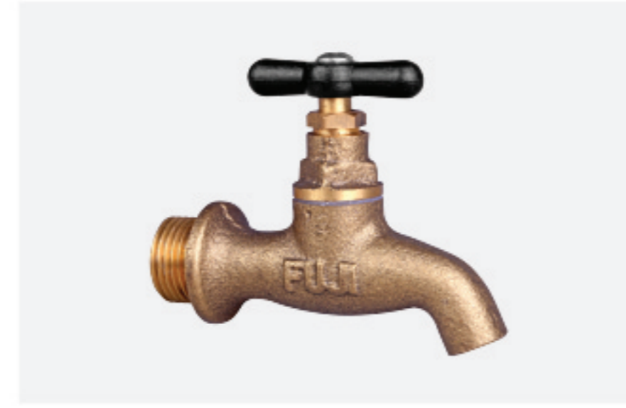
ATAP KRAN/BIB COCK/ KRAN AIR RUMAH TANGGA - Sistem sambungan: ulir standar BSPP/ISO 228/1 - Ukuran: 1/2" - 3/4" - Connection system: thread standard BSPP/ISO 228/1 - Size: 1/2" - 3/4"