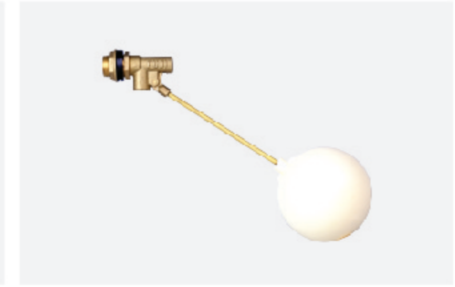
FLOATING VALVE/FLUTTER - Sistem sambungan: ulir standar BSPP/ISO 228/1 - Ukuran: 1/2" - 1" - Connection system: thread standard BSPP/ISO 228/1 - Size: 1/2" - 1"