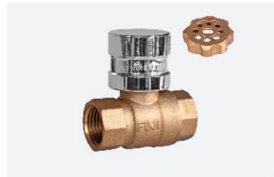
MAGNETIC LOCKABLE BALL VALVE (FOR THREADED PIPE WITH COUPLING - SHORT TYPE) - Kelas: PN10/PN16 - Sistem sambungan: ulir standar BSPT/ISO 7/1 - Ukuran: 1/2" - 2" - Dilengkapi alat pengunci sistem magnetis - Class: PN10/PN16 - Connection system: thread standard BSPT/ISO 7/1 - Size: 1/2" - 2" - Equipped with a magnetic locking system