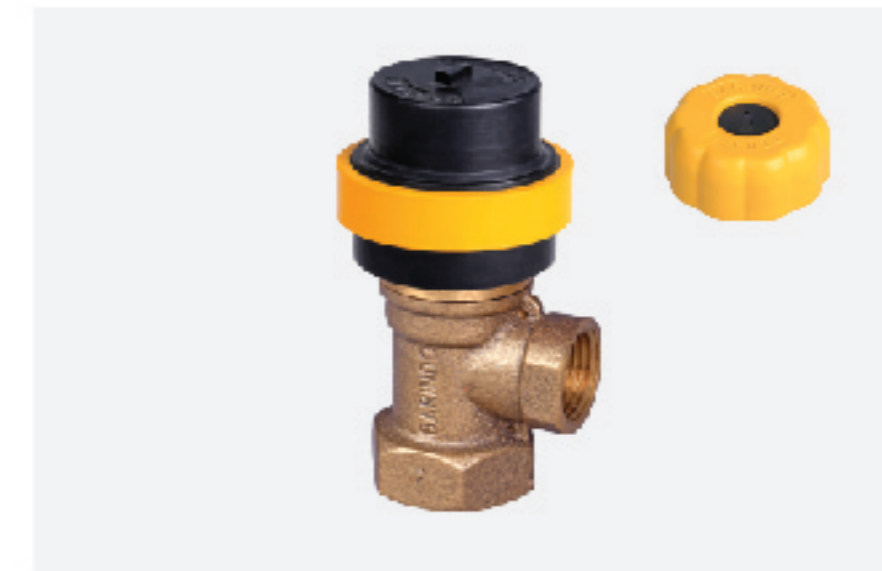
METER VALVE REDUCED PORT (FOR THREADED PIPE) - Kelas: PN10/PN16 - Sistem sambungan: inlet menggunakan adaptor compression fitting (untuk disambung pipa plastik) atau adapter ulir standar BSPT/ISO 7/1 (untuk disambung pipa GI) dan outlet ulir standar BSPT/ISO 7/1 - Ukuran: 1/2" x 1/2" dan 1/2" x 3/4" - Dilengkapi alat pengunci sistem magnetis - Class: PN10/PN16 - Connection system: inlet using adaptor compression fitting (to connect plastic pipe) or adaptor thread standard BSPT/ISO 7/1 (to connect GI pipe) and outlet thread standard BSPT/ISO 7/1 - Size: 1/2" x 1/2" and 1/2" x 3/4" - Equipped with a magnetic locking system