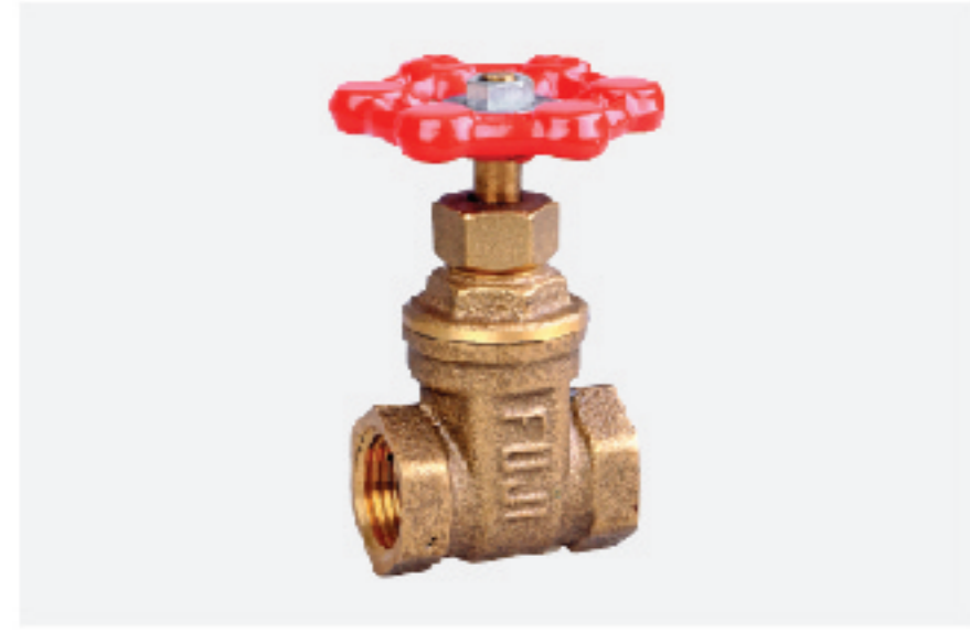
STOP VALVE/GATE VALVE/KATUP PINTU - Kelas: 125 WOG/150 WOG/200 WOG - Sistem sambungan: ulir standar BSPT/ISO 7/1 - Ukuran: 1/2" - 4" - Class: 125 WOG/150 WOG/200 WOG - Connection system: thread standard BSPT/ISO 7/1 - Size: 1/2" - 4"