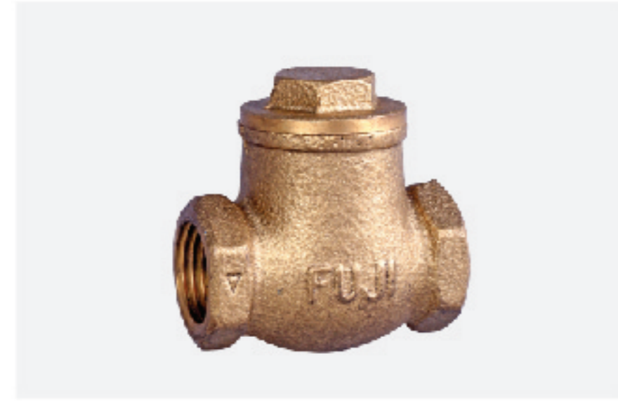
CHECK VALVE/KATUP SEARAH HORIZONTAL - Sistem sambungan: ulir standar BSPT/ISO 7/1 - Ukuran: 1/2" - 4" - Connection system: thread standard BSPT/ISO 7/1 - Size: 1/2" - 4"