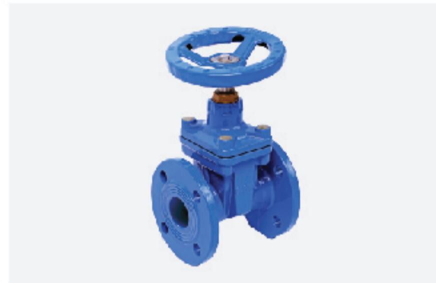
RESILIENT GATE VALVE - Kelas: PN10/PN16 - Sistem sambungan: flange - Ukuran: 2" - 40"