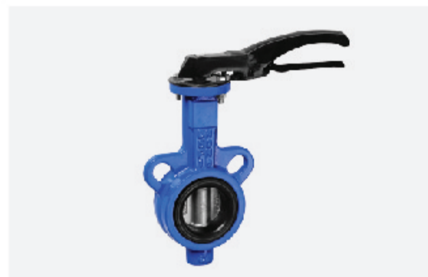
RESILIENT BUTTERFLY VALVE DOUBLE WAFER - Kelas: PN10/PN16 - Sistem sambungan: wafer - Ukuran Type Handle : 2" - 12"