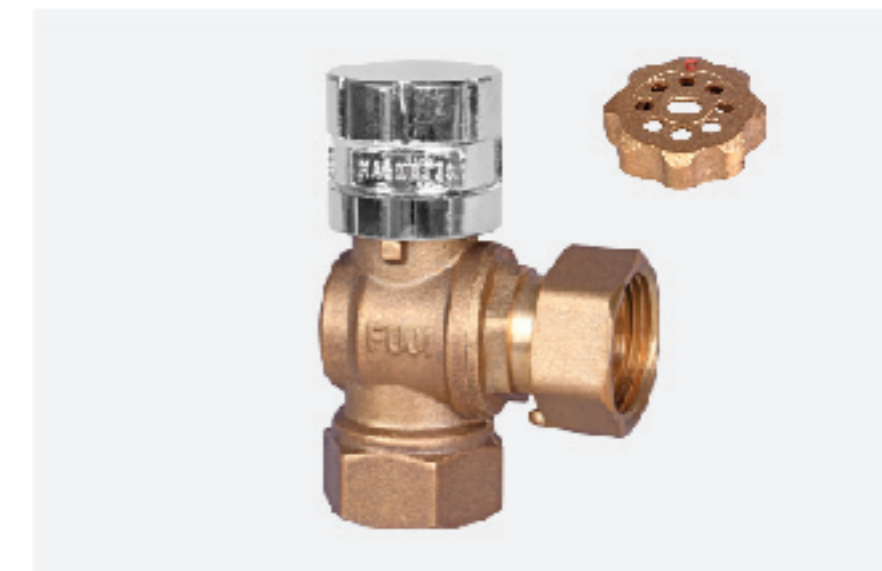
MAGNETIC ANGLE LOCKABLE BALL VALVE (FOR THREADED PIPE WITH COUPLING) - Kelas: PN10/PN16 - Sistem sambungan: ulir standar BSPT/ISO 7/1 (untuk disambung pipa GI) dan outlet coupling ring dengan ulir 3/4" standar BSPP/ISO 228/1 - Ukuran: DN15 x 3/4" x 1/2", DN15 x 3/4" x 3/4" - Dilengkapi alat pengunci sistem magnetis - Class: PN10/PN16 - Connection system: thread standard BSPT/ISO 7/1 (to connect GI pipe) and outlet coupling ring with thread 3/4" standard BSPP/ISO 228/1 - Size: DN15 x 3/4" x 1/2", DN15 x 3/4" x 3/4" - Equipped with a magnetic locking system