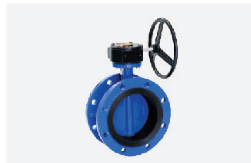
RESILIENT BUTTERFLY VALVE DOUBLE FLANGE - Kelas: PN10/PN16 - Sistem sambungan: flange - Ukuran Type Gear Box : 2" - 48"