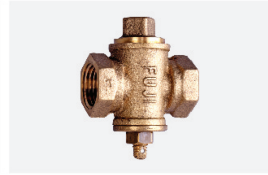
PLUG KRAN/KATUP SUMBAT/PLUG VALVE - Sistem sambungan: ulir standar BSPT/ISO 7/1 - Ukuran: 1/2" - 1" - Connection system: thread standard BSPT/ISO 7/1 - Size: 1/2" - 1"