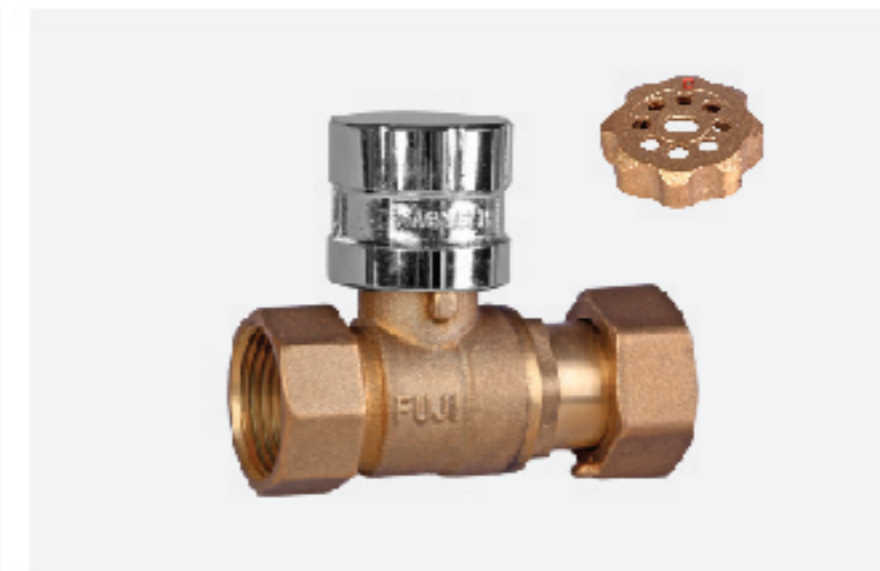
MAGNETIC STRAIGHT LOCKABLE BALL VALVE (FOR THREADED PIPE WITH COUPLING) - Kelas: PN10/PN16 - Sistem sambungan: ulir standar BSPT/ISO 7/1 (untuk disambung pipa GI) dan outlet coupling ring dengan ulir 3/4" standar BSPP/ISO 228/1 - Ukuran: DN15 x 3/4" x 1/2", DN15 x 3/4" x 3/4" - Dilengkapi alat pengunci sistem magnetis - Class: PN10/PN16 - Connection system: thread standard BSPT/ISO 7/1 (to connect GI pipe) and outlet coupling ring with thread 3/4" standard BSPP/ISO 228/1 - Size: DN15 x 3/4" x 1/2", DN15 x 3/4" x 3/4" - Equipped with a magnetic locking system