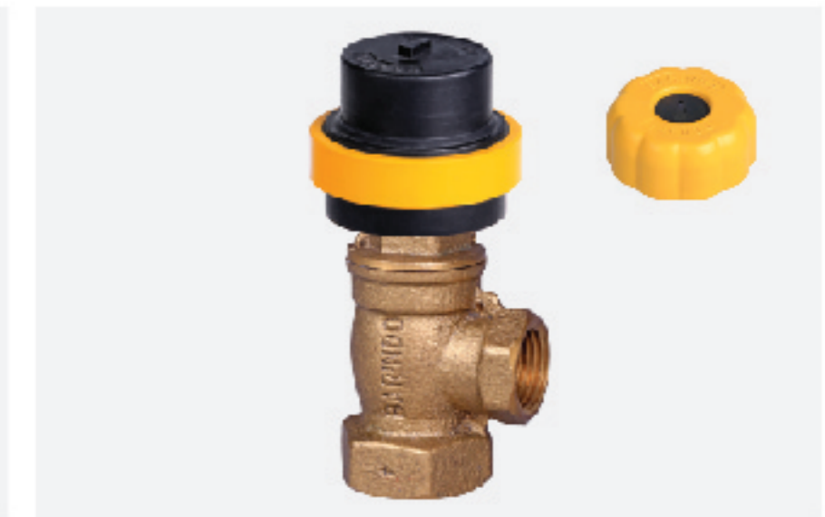
METER VALVE WITH CHECK VALVE SNI (FOR THREADED PIPE) - Kelas: PN10/PN16 - Sistem sambungan: inlet menggunakan adaptor compression fitting (untuk disambung pipa plastik) atau adapter ulir standar BSPT/ISO 7/1 (untuk disambung pipa GI) dan outlet ulir standar BSPT/ISO 7/1 - Ukuran: 1/2" x 1/2", 1/2" x 3/4", 1/2" x 20 mm, 1/2" x 25 mm - Dilengkapi alat pengunci sistem magnetis - Class: PN10/PN16 - Connection system: inlet using adaptor compression fitting (to connect plastic pipe) or adaptor thread standard BSPT/ISO 7/1 (to connect GI pipe) and outlet thread standard BSPT/ISO 7/1 - Size: 1/2" x 1/2", 1/2" x 3/4", 1/2" x 20 mm, 1/2" x 25 mm - Equipped with a magnetic locking system