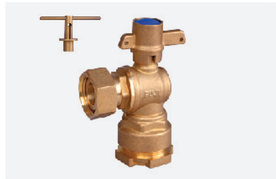
ANGLE LOCKABLE BALL VALVE (FOR HDPE PIPE) - Kelas: PN10/PN16 - Sistem sambungan: inlet compression fitting (untuk disambung pipa plastik) dan outlet coupling ring dengan ulir 3/4" standar BSPP/ISO 228/1 - Ukuran: DN15 x 3/4" x 20 mm, DN15 x 3/4" x 25 mm - Dilengkapi alat pengunci sistem mekanis - Class: PN10/PN16 - Connection system: inlet compression fitting (to connect plastic pipe) and outlet coupling ring with thread 3/4" standard BSPP/ISO 228/1 - Size: DN15 x 3/4" x 20 mm, DN15 x 3/4" x 25 mm - Equipped with a mechanical locking system