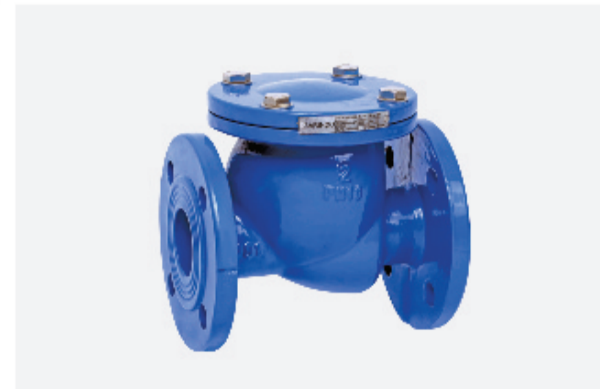
RESILIENT CHECK VALVE - Sistem sambungan: flange - Ukuran: 2" - 24"