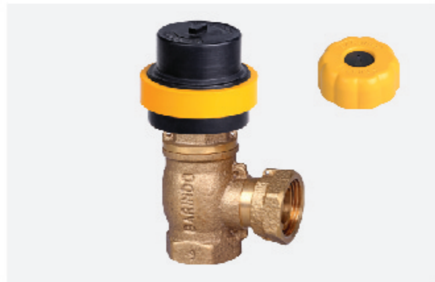
METER VALVE WITH CHECK VALVE AND COUPLING SNI (FOR THREADED PIPE) - Kelas: PN10/PN16 - Sistem sambungan: ulir standar BSPT/ISO 7/1 (untuk disambung pipa GI) dan outlet coupling ring dengan ulir 3/4" standar BSPP/ISO 228/1 - Ukuran: 3/4" x 1/2" dan 3/4" x 3/4" - Dilengkapi alat pengunci sistem magnetis - Class: PN10/PN16 - Connection system: thread standard BSPT/ISO 7/1 (to connect GI pipe) and outlet coupling ring with thread 3/4" standard BSPP/ISO 228/1 - Size: 3/4" x 1/2" and 3/4" x 3/4" - Equipped with a magnetic locking system