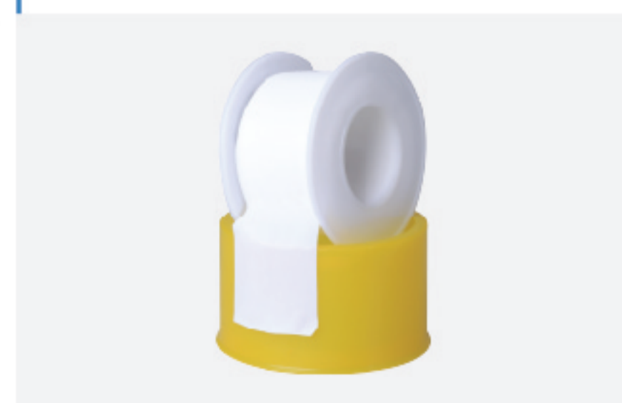
SEAL TAPE - Ukuran: a. Lebar: 12 mm, 19 mm, 25 mm b. Panjang: 10 m - 50 m c. Tebal: 0,075 mm - 0,2 mm