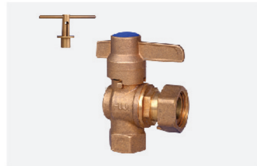
ANGLE LOCKABLE BALL VALVE (FOR THREADED PIPE) - Kelas: PN10/PN16 - Sistem sambungan: ulir standar BSPT/ISO 7/1 (untuk disambung pipa GI) dan outlet coupling ring dengan ulir 3/4" standar BSPP/ISO 228/1 - Ukuran: DN15 x 3/4" x 1/2", DN15 x 3/4" x 3/4" - Dilengkapi alat pengunci sistem mekanis - Class: PN10/PN16 - Connection system: thread standard BSPT/ISO 7/1 (to connect GI pipe) and outlet coupling ring with thread 3/4" standard BSPP/ISO 228/1 - Size: DN15 x 3/4" x 1/2", DN15 x 3/4" x 3/4" - Equipped with a mechanical locking system