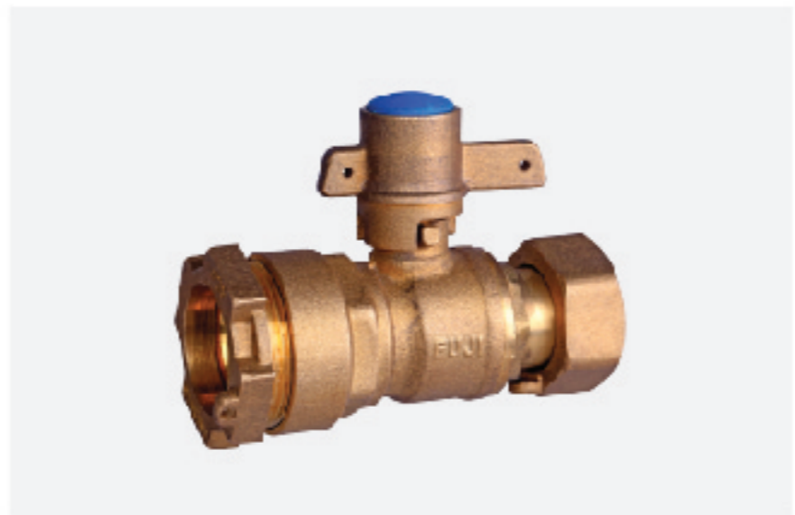
STRAIGHT LOCKABLE BALL VALVE (FOR HDPE PIPE) - Kelas: PN10/PN16 - Sistem sambungan: inlet compression fitting (untuk disambung pipa plastik) dan outlet coupling ring dengan ulir 3/4" standar BSPP/ISO 228/1 - Ukuran: DN15 x 3/4" x 20 mm, DN15 x 3/4" x 25 mm - Dilengkapi alat pengunci sistem mekanis - Class: PN10/PN16 - Connection system: inlet compression fitting (to connect plastic pipe) and outlet coupling ring with thread 3/4" standard BSPP/ISO 228/1 - Size: DN15 x 3/4" x 20 mm, DN15 x 3/4" x 25 mm - Equipped with a mechanical locking system