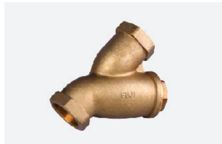
Y STRAINER/FILTER Y/SARINGAN Y - Sistem sambungan: ulir standar BSPT/ISO 7/1 - Ukuran: 1/2" - 2" - Connection system: thread standard BSPT/ISO 7/1 - Size: 1/2" - 2"