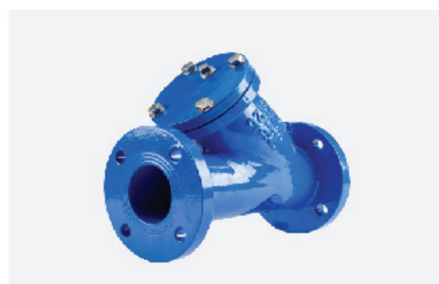
Y STRAINER - Sistem sambungan: flange - Ukuran: 2" - 16"