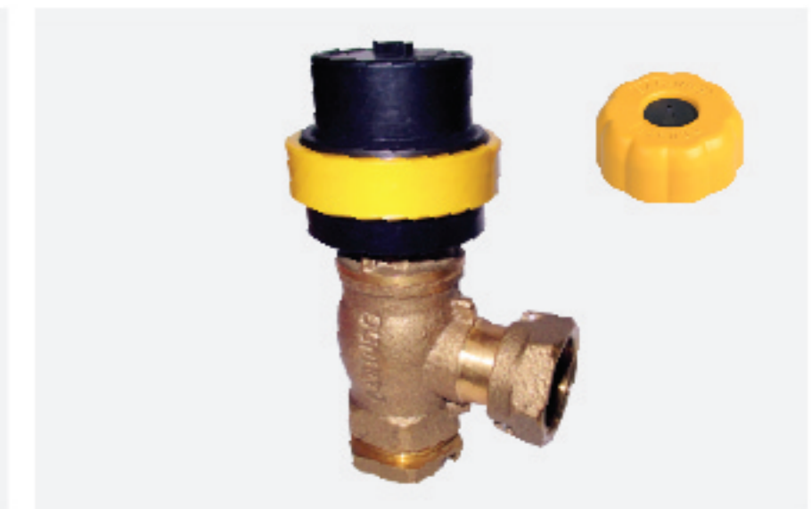
MAGNETIC ANGLE LOCKABLE WITH CHECK VALVE (FOR HDPE PIPE WITH COUPLING) - Kelas: PN10/PN16 - Sistem sambungan: inlet compression fitting (untuk disambung pipa plastik) dan outlet coupling ring dengan ulir 3/4" standar BSPP/ISO 228/1 - Ukuran: DN15 x 3/4" x 20 mm, DN15 x 3/4" x 25 mm - Dilengkapi alat pengunci sistem magnetis - Class: PN10/PN16 - Connection system: inlet compression fitting (to connect plastic pipe) and outlet coupling ring with thread 3/4" standard BSPP/ISO 228/1 - Size: DN15 x 3/4" x 20 mm, DN15 x 3/4" x 25 mm - Equipped with a magnetic locking system