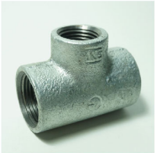
TEES Range Ukuran: 1/4" - 2"