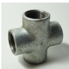
CROSSES Range Ukuran: 1/2" - 4"