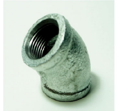
ELBOW 45° Range Ukuran: 1/2" - 6"