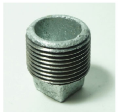
PLUGS Range Ukuran: 1/4" - 6"