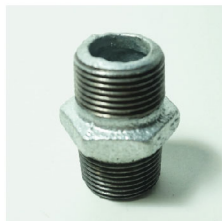
DOUBLE/HEXAGON NIPPLE Range Ukuran: 1/4" - 6"