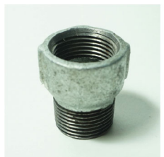
EXTENSION PIECES Range Ukuran: 1/2" - 1"