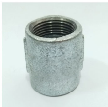
SOCKETS Range Ukuran: 1/2" - 2"