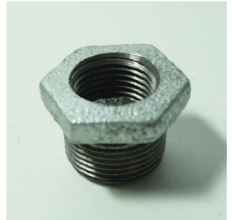
V-RING/BUSHINGS Range Ukuran: 3/8" x 1/4" - 6" x 4"