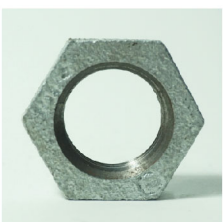
RING/LOCKNUTS Range Ukuran: 1/2" - 6"