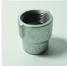
REDUCING SOCKET Range Ukuran: 3/8" x 1/4" - 2" x 1 1/2"