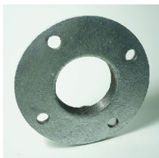
ROUND FLANGES Range Ukuran: 1/2" - 6"