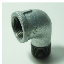
STREET ELBOW 90° Range Ukuran: 1/2" - 3"