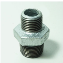
REDUCING HEXAGON NIPPLES Range Ukuran: 3/4" x 1/2" - 1 1/4" x 1"