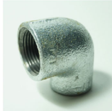
REDUCING ELBOW 90° Range Ukuran: 3/4" x 1/2" - 1 1/2" x 1"