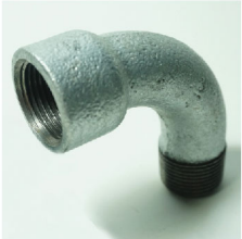
BENDS LONG MALE & FEMALE 90° Range Ukuran: 1/2" - 4"