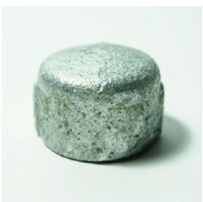
DOP/CAPS Range Ukuran: 1/2" - 6"