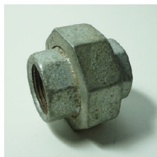
WATER MOER/UNION Range Ukuran: 1/4" - 6"